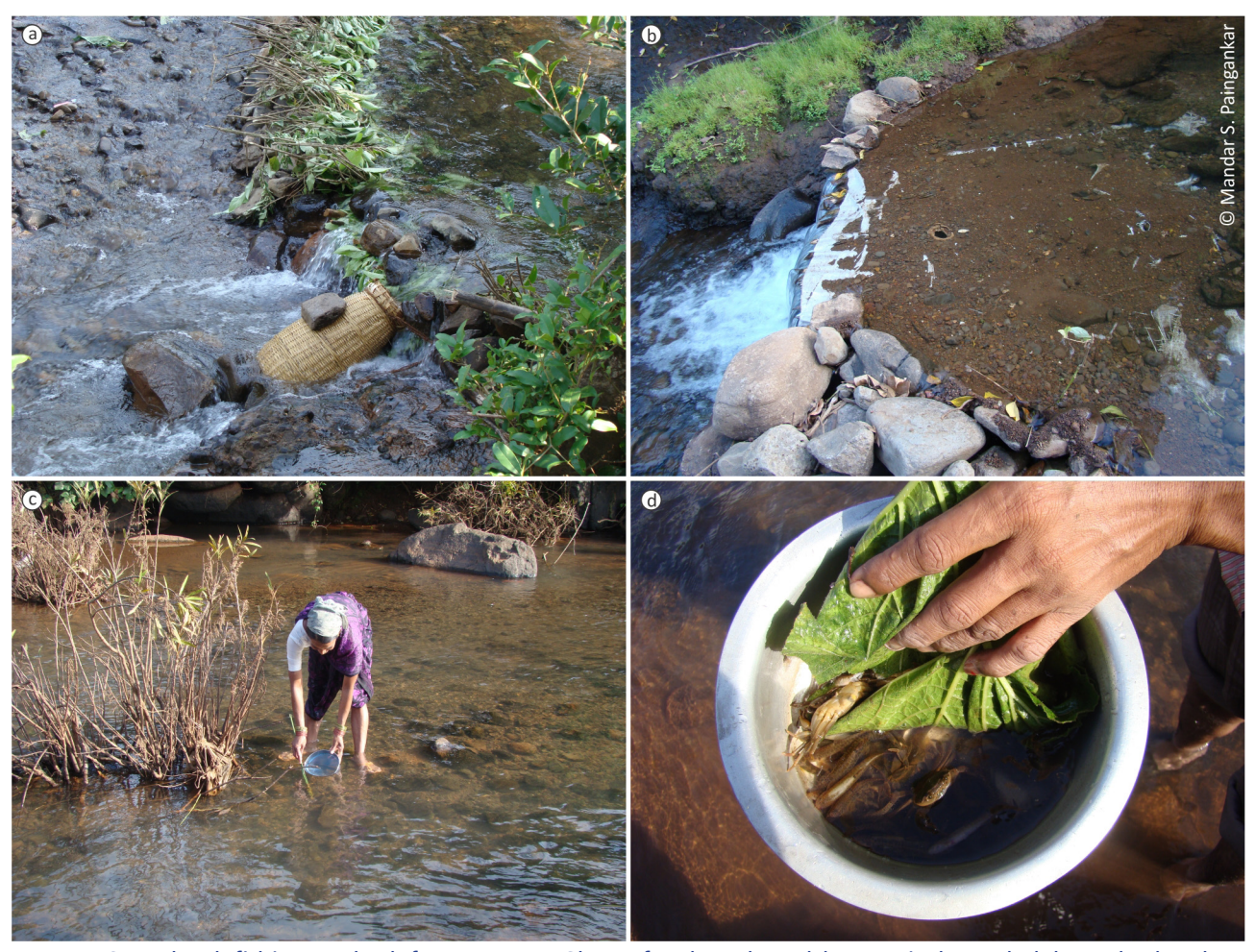
Image 4. Some loach fishing methods from Western Ghats of Maharashtra. (a) Water is channeled through a bamboo basket, (b) a false stream bed is made up of bamboo sheet and a bamboo basket is hidden under it, (c) stick with worms tied on its end is held in water for some time till loaches start feeding on the worms and the attached loaches are collected in a strainer, and (d) collected loaches.

Loaches do not form a part of a major fishery but they are either caught by local people during the late monsoon and early winter months for consumption or are collected by Katkari tribe for selling in the local fish markets. Normally, Katkari tribe people catch the loaches with a cloth by using it like a drag nets, however there are other three methods which are also used (Image 4). Because loaches do not form a major part of fisheries, fishing is not a threat to the loaches of the northern Western Ghats. This is also evident from the population dynamics of Acanthocobitis mooreh , which has suggested that fishing mortality is low in the species (Kharat & Dahanukar 2013).