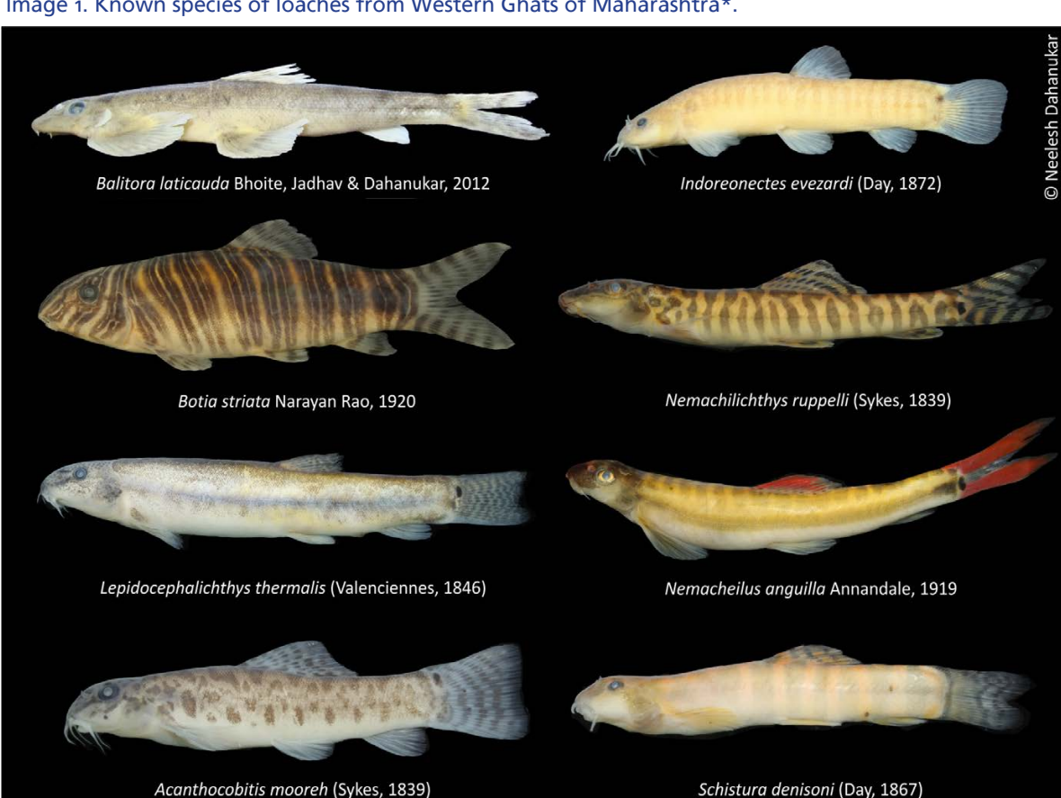
Image 1. Known species of loaches from Western Ghats of Maharashtra*.

Highlights: Fighting against the water current, the hill stream loaches live their life in the fast lane and occupy niches that only few others can dare to dwell in. With their beautiful color patterns, hill stream I loaches are often found in rapidly flowing waters, clinging on to the rocks and plants, swiftly swimming in \, \, f I \, torrents and suddenly disappearing under the pebbles and gravel. Relatively fewer studies in the northern Western Ghats of India, have rendered the true diversity of loaches from this region to be obscure. Recreational activities on the mountain tops, habitat modifications, siltation and pollution are rapidly degrading the pristine habitats that these loaches are accustomed to live in. These beautiful fishes are also exported trough aquarium pet trade in high numbers. Unless we care, it will be just a matter of time before these beautiful jewels disappear from the face of earth.