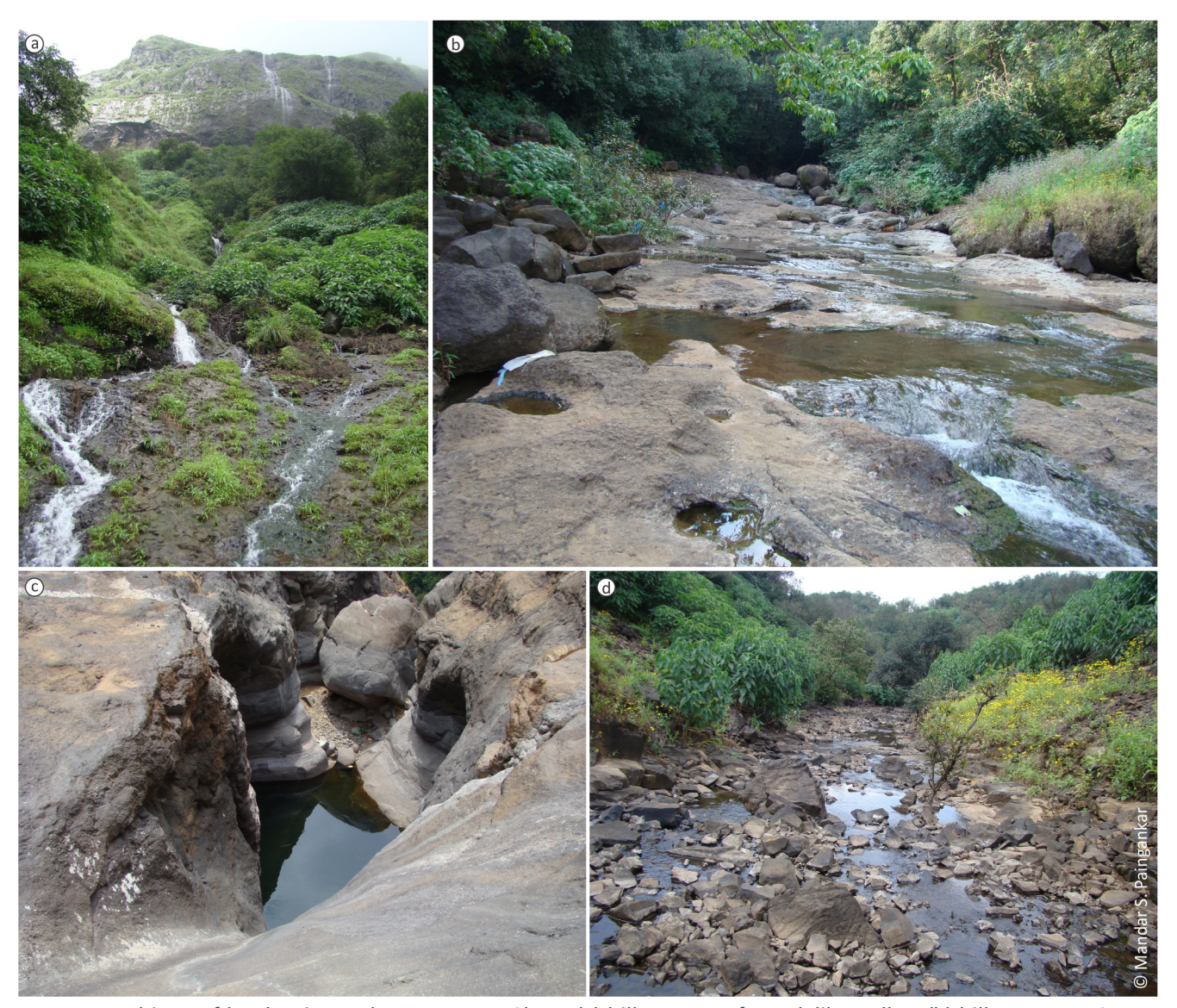
Image 3. Habitats of loaches in northern Western Ghats: (a) hill streams of Kundalika Valley, (b) hill stream at Gupta Bhima, the origin of Bhia River, (c) summer time refuge in the ditches of a dried stream of Plus Valley in Mulshi, and (d) stream with pebbles, gravel and stones at Ghod River origin.

Western Ghats breed during the monsoon season. In the case of Acanthocobitis mooreh , it has been suggested that the species breeds twice in a year once during August-September and second time during February-March (Kharat et al. 2008).