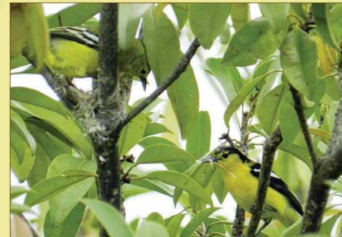
Female is building the nest and male is provisioning nest material