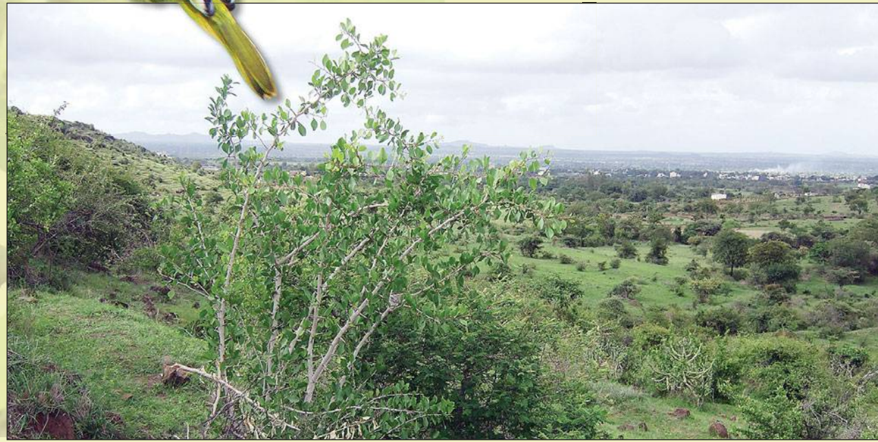
A hill slope with sparse woodland is a typical lora habitat