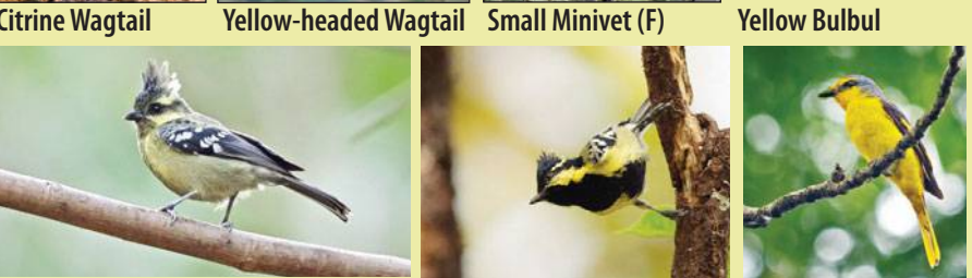
Citrine Wagtail Yellow-headed Wagtail Small Minivet (F) Yellow Bulbul Black-lored Yellow Tit Scarlet Minivet (F)

The Common lora has a good repertoire of calls and songs that gives away the bird before it is seen. One of its frequently heard calls is a sweet melodious gently undulating whistle uttered in an unhurried manner. The sonogram shows that it goes up and down in frequency in three distinct notes. Each whistle lasts about a second in duration ranging between 2200 to 3000 Hz in frequency.