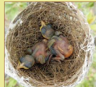
The nest is conspicuous due to white cobweb plastering. Eggs and naked chicks are seen in the nest