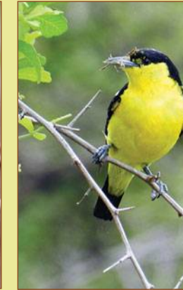
Female and male lora with nesting material