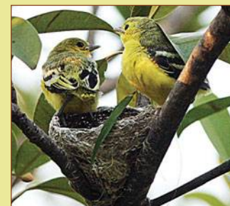
The chicks quickly change the plumage colour to attain adult plumage prior to fledging. This is an amazing progression