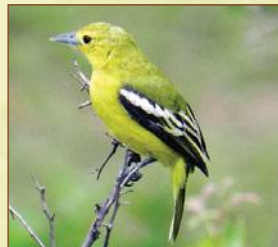
Arboreal habit of the lora